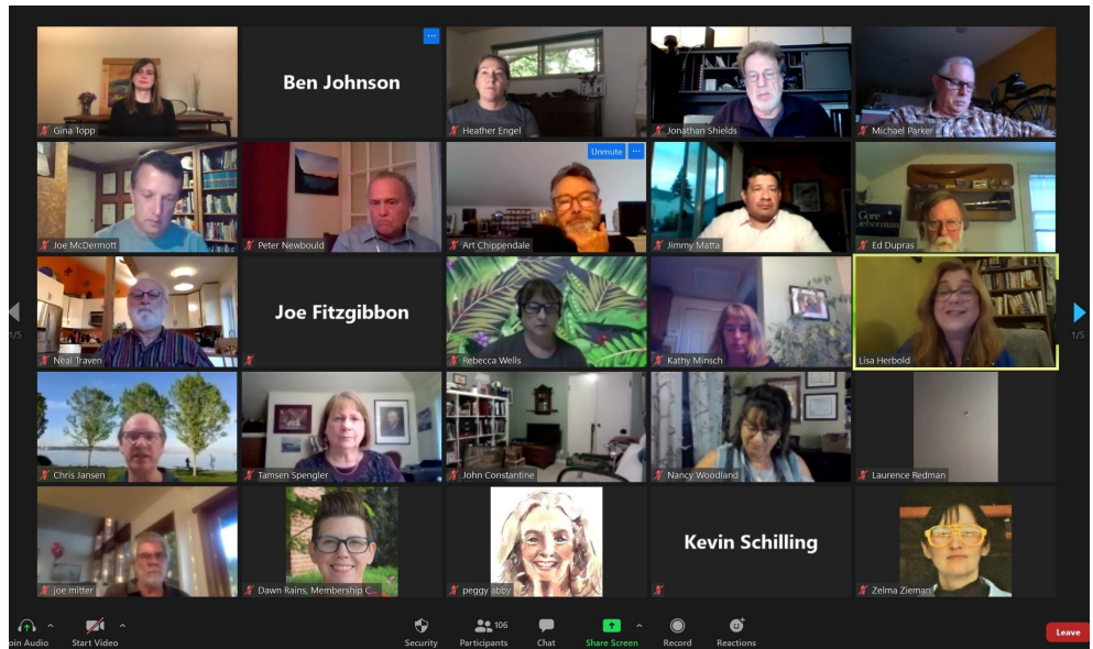
A few of the members at our first Zoom Meeting

She said we must make sure to protect paychecks, and access to healthcare. Much more resources need to go to state and local governments to maintain existing services and keep first responders and essential government employees on the job. Our economic support packages must be pro worker instead of handouts to corporations. During this crisis we must expand Medicare, and we need mortgage and rent relief. ICE must release detainees to prevent hot spots at their facilities.