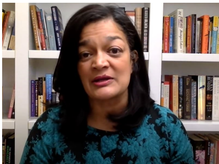
Rep. Pramila Jayapal addressed us from home

35 million unemployment claims had been filed, causing huge burdens on states. Many lower income workers are unable to collect unemployment benefits, due to factors such as working in the gig economy outside of traditional employment.