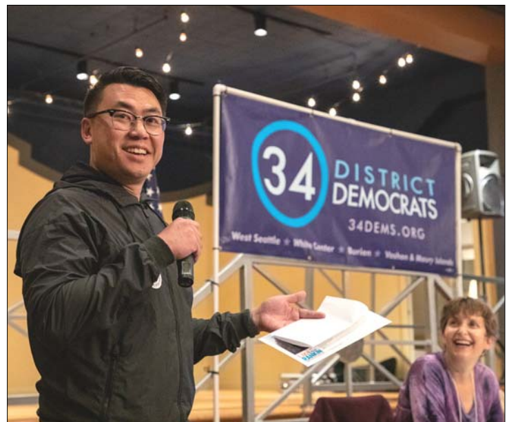
Sen Joe Nguyen speaks about the short session in Olympia coming up.