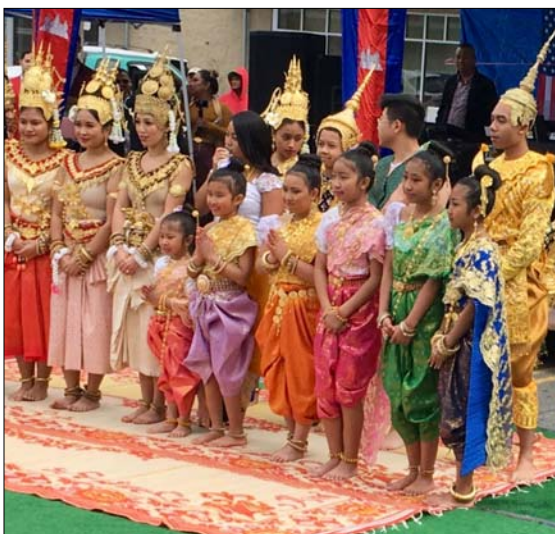
Part of the colorful pageantry at the White Center Cambodian New Years Festival where we registered 14 voters on April 27.