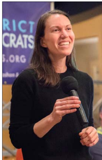
An organizer for I-1631 asks for our help.

An organizer for the YES on I-1631 spoke to us and encouraged us to sign up to help their canvassing campaign. They have a goal of knocking 90,000 doors before the election. She said that support for I-1631 had grown to over 400 businesses and organizations, and that Bill Gates had just announced his approval and contribution the day before.