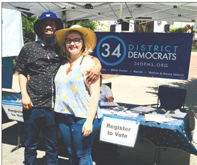
An unnamed couple at our West Seattle Summerfest booth.