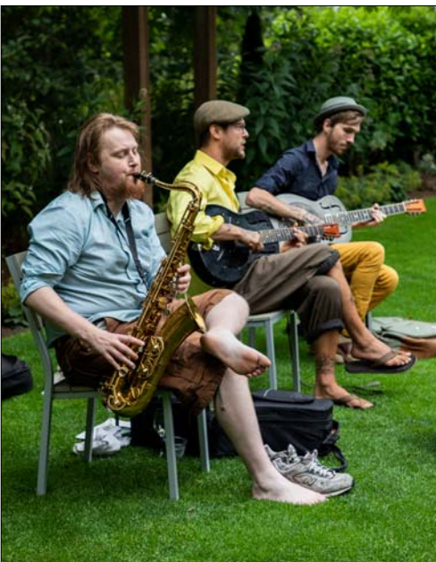
The Speakeasy Jazz Cats entertaining us for a second year in a row