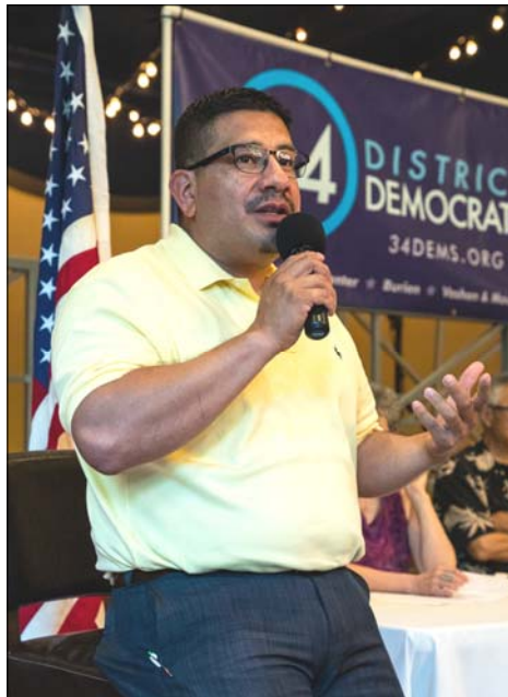
Burien Mayor Jimmy Matta