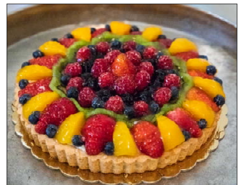
One of the great Dessert Dash selections