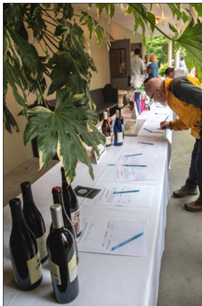
The Silent Auction Table