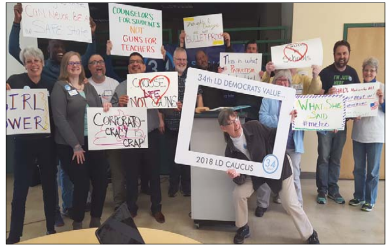
34th Democrats show their values