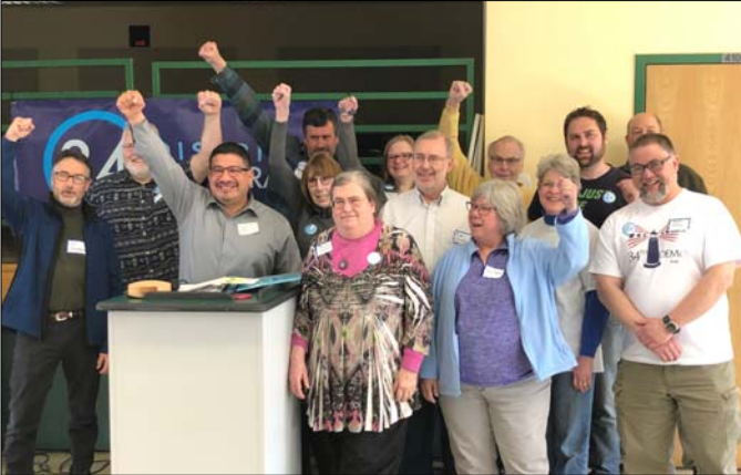
Our delegates to the state convention.