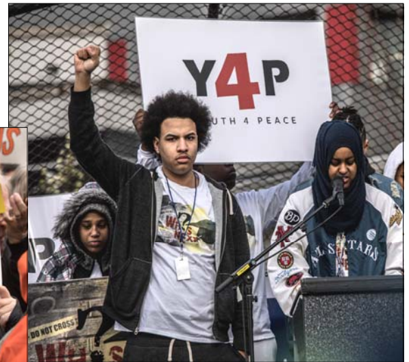
Scenes from the March For Our Lives March 24, 2018