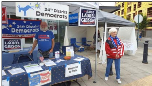
2016 Burien Strawberry Festival, with volunteers from the 33rd.