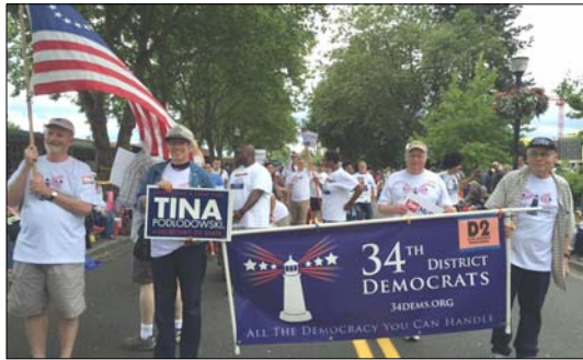
2016 West Seattle Grand Parade