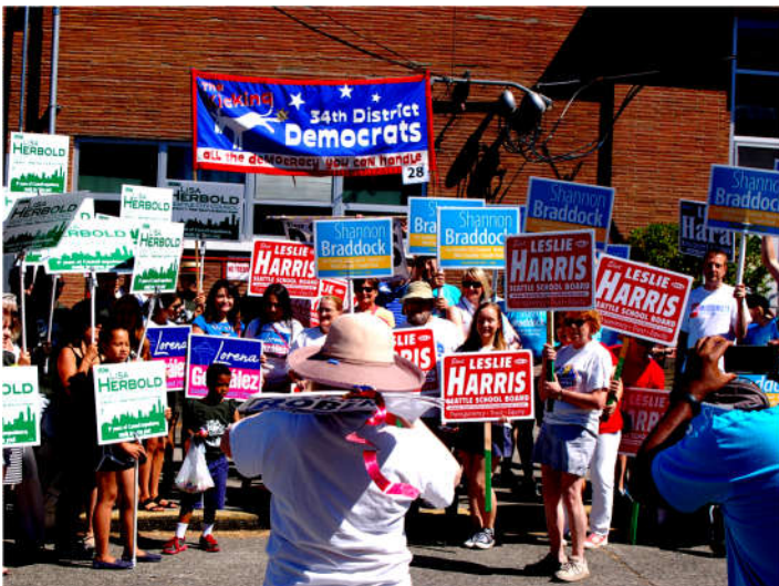
Photo Ops before the West Seattle Parade