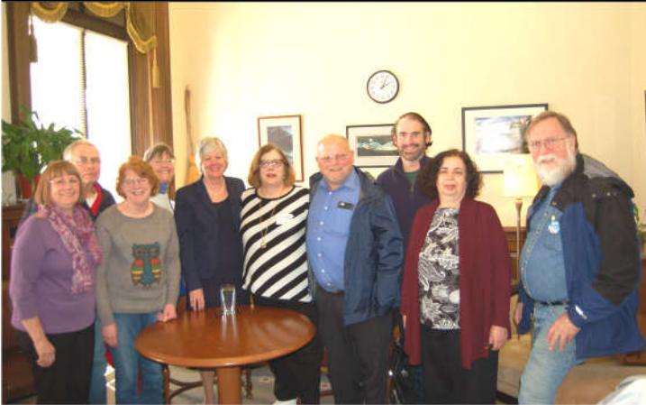
The Legislative Action Committee in Olympia on Presidents Day