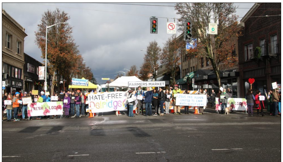
Photos from the rally against anti-Semitism Sunday, December 2 in The Junction. The rally was organized by Hate Free Delridge, to show support for victims of anti-Semitic vandalism to homes in Sunrise Heights the previous week.