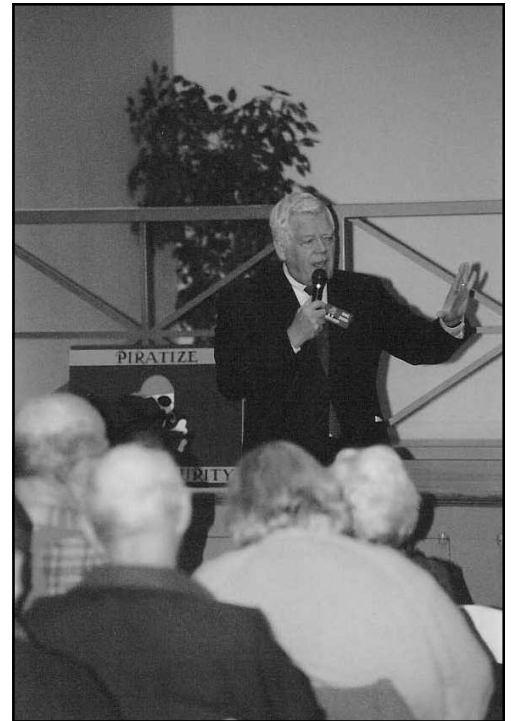
Congressman Jim McDermott speaking to us about Social Security at the January 12 meeting