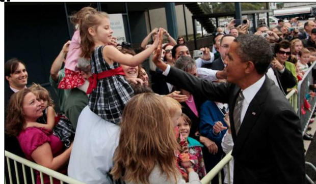
President Obama greeting young well wishers at the Seat-Tac Airport on September 25

Some of the local news organizations have been referring to the September 25 rally at the Paramount Theater as a protest. Maybe some were protesting, but we, the 34th District Democrats, were there, as were other Democratic organizations, and we were not there to protest! From the interviews with Puget Sound Alliance for Retired Americans, they weren't there to protest either. People were there to spur the President on after the announcement of his jobs bill and to let him know he has our support, but please don't cut Medicare, Medicaid or Social Security.