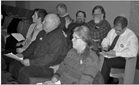
Waiting for something - anything - to happen

Around 20 to 25 of our members attended the December 14 meeting when the County Council was scheduled to appoint a replacement for Dow Constantine. Some came early, some came after work; some had to leave early, and some stayed for the whole ordeal.